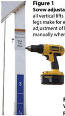
Figure 1 Screw adjustable leveling leg kit. Available on all vertical lifts 3000 lbs to 6000 lbs. The screw legs make for easy leveling and height adjustment of lift. Also, eliminates lifting manually when installing stationary wheel kit.