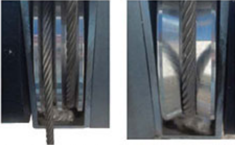
The "V" shaped aluminum pulleys with brass oilite bushing riding on a stainless steel, greasable pins with stainless cables are designed for years of trouble free use.