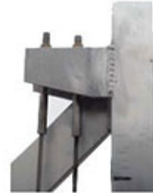
Figure 4 Custom made cable ends are made with stainless steel cables and machined stainless steel studs for years of worry free use.