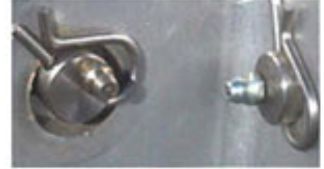
Custom pins with grease zerks make it easy to grease your pulleys to reduce pulley and cable wear and makes lift operation smoother. Simplifies maintaining your lift.